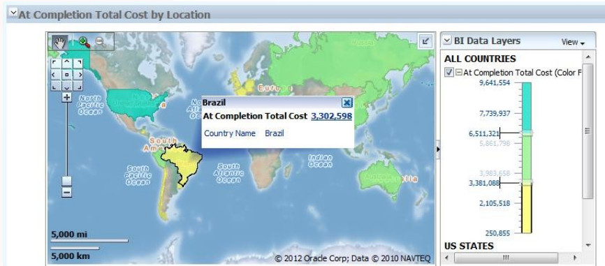
Figure 3. Geospatial maps allow project, cost, business process, resource, and activity metrics to be visualized by geographic location with full drilldown capabilities.

You can focus on and directly improve your project performance with early-warning indicators, trending and forecasting. Primavera Analytics alerts you about problem areas in your projects and allows you to take corrective action to keep your projects on track.