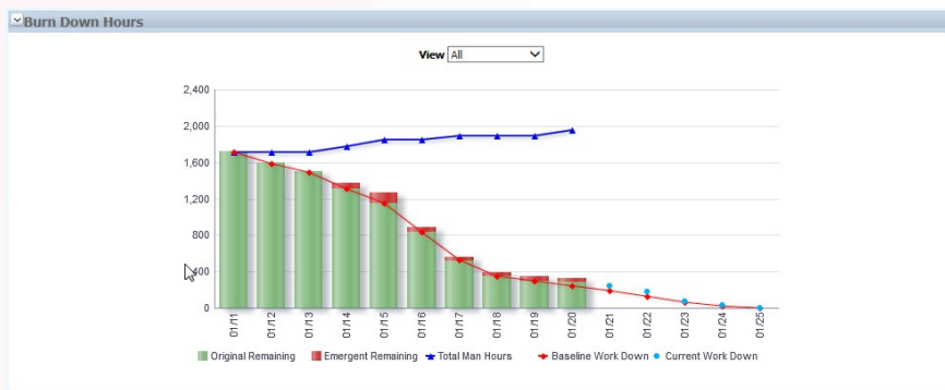
Figure 2. Burn down charts with drill-down features provide valuable insight into project progress.

You will quickly identify which projects are performing well and exceeding expectations, as well as those negatively affecting your portfolios, your budgets, your cash flow, and your staffing issues. By focusing on the problem areas, you can direct proper management attention to projects which do not align to strategic objectives, are over- budget, or are under-performing.